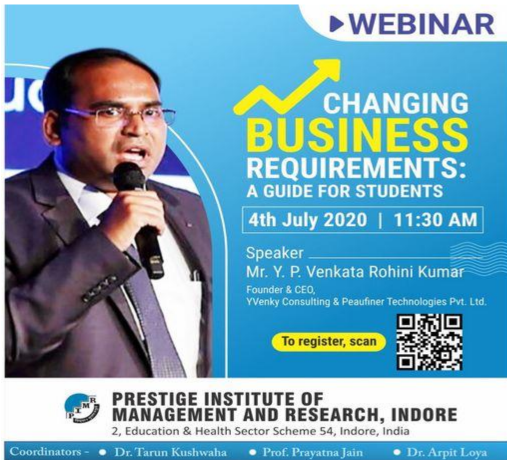
Figure 1: Poster of the Event